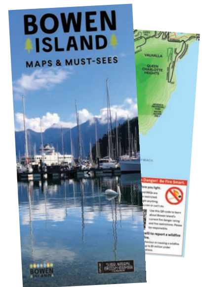
2023 Visitor Map, including responsible visitor guidance. 40,000 printed & distributed.

Strengthening industry partnerships with local and regional benefits, such as Don't Love it to Death campaign. Our promotional efforts are leveraged through Destination BC, Destination Canada, and Tourism Vancouver.